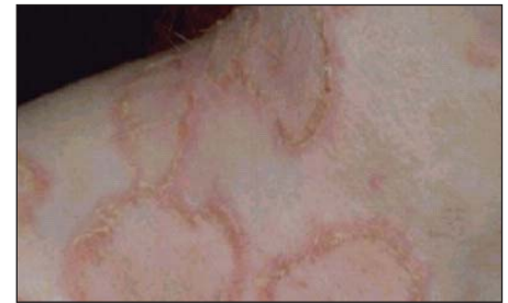
CLINICAL PRESENTATION: Blisters on the skin

Mucous membranes typically are affected first in PV. Mucosal lesions may precede cutaneous lesions by months. Patients have ill-defined, irregularly shaped, gingival, buccal or palatine erosions, which are painful and slow to heal. The erosions extend peripherally with shedding of the epithelium. Other mucosal surfaces may be involved, including the conjunctiva, esophagus, labia, vagina, cervix, penis, urethra, and anus. The primary lesion of PV is a flaccid blister filled with clear fluid that arises on normal skin or mucosa. These blisters are fragile, so, intact blisters may be sparse. The contents soon become turbid or the blisters rupture producing painful erosions, which is the most common skin presentation. Erosions often are large because of their tendency to extend peripherally with the shedding of the epithelium. Nikolsky sign (firm sliding pressure with a finger separates normal-appearing epidermis producing an erosion) and Asboe-Hansen sign (Lateral pressure on the edge of a blister may spread the blister) may be positive.