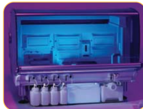
The dark cover protects your reagents and reactions from environmental contaminants, securely locking during the entire assay run.