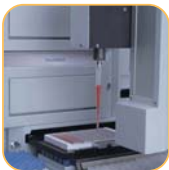
The DSX robotic arm moves microplates and pipettes all sample and reagents.