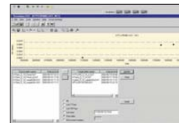
Revelation software incorporates Levey-Jennings statistical analysis.

Pipette Security. Fluid level sensing, tip detection, tip-ejection and clot detection functions protect your assay as well as the DSX robotic pipette.