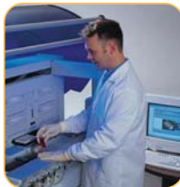
The DSX simplifies workload setup by walking you through where to load consumables and samples