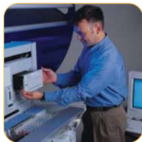
The DSX modular design simplifies upgrades and repairs.